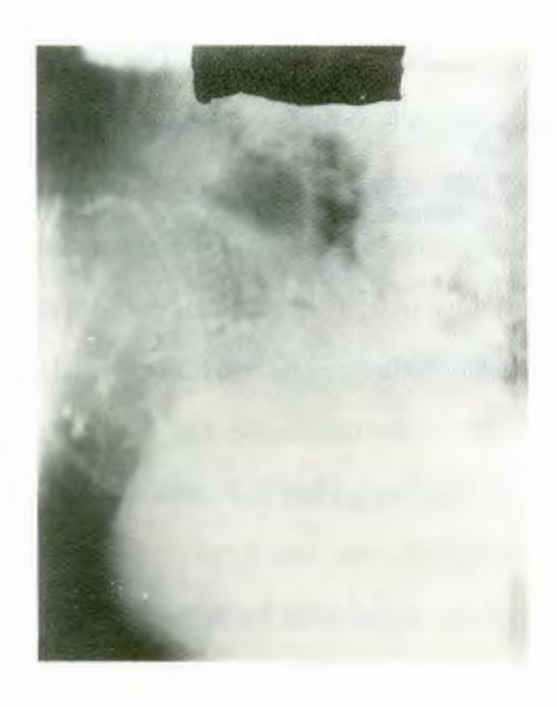
Fig.-1, Both Vertex, one in advance of other in the pelvis.

suspected to have twin pregnancy that was confirmed by X-ray on 26.8.96 as both presenting by vertex. On 7.9.96 she went in labour. Inspite of good contractions